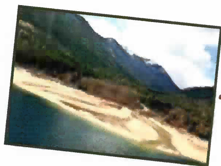
Dark Woods Forest. Protected by LTABC member The Nature Trust of BC.