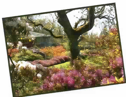
Abkhazi Gardens in Victoria, BC. Protected by LTABC member The Land Conservancy.

If you have any other questions, please don't hesitate to contact LTABC at 250.477.4766.